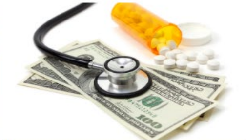
Lowering the Cost of Care