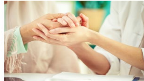
End Of Life