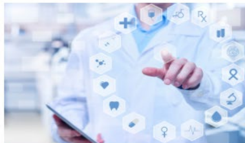
Redesigning the Health System