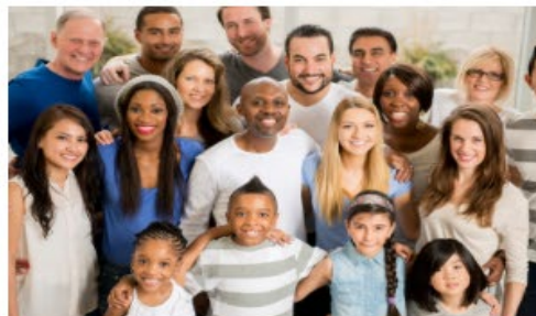
Creating Healthy Communities